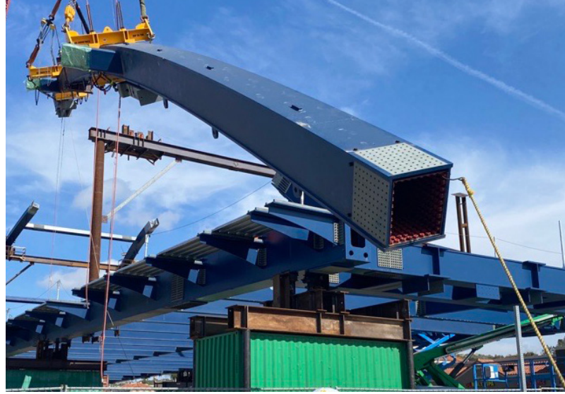
An arch rib with Shuriken being lifted into place. Walsh prepared complex rigging to lift the tilted arch ribs in the proper orientation.

All these innovations came together to give Corona a beautiful, efficient new bridge as well as a safer and better-connected community.