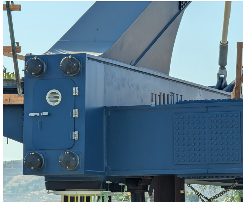
A “knuckle” of the bridge, where a support diaphragm, arch rib, and tie girder come together. The anchorages for the four post tensioned cables are visible.

Introducing the HSS Connections Hub™ Fabrication-friendly, fully code referenced, and reliable HSS connections.