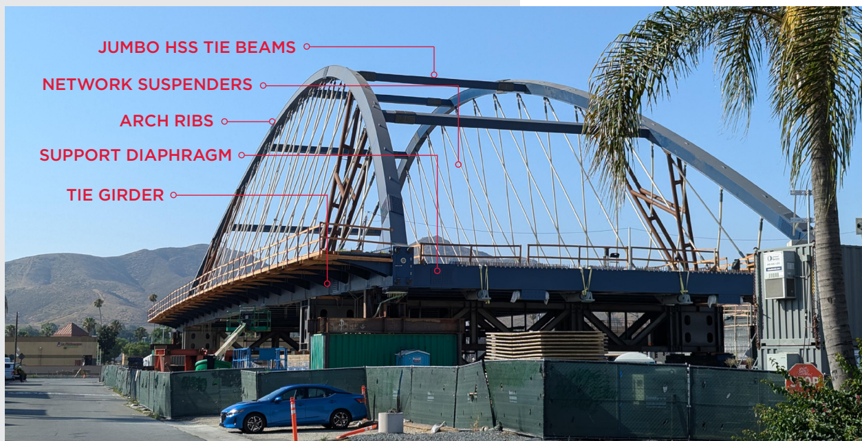
Overall shot showing the various structural elements.

Walsh Construction, the largest bridge builder in the country, was chosen as the general contractor, and they assembled an all-star team to make the project a reality. Thompson Metal Fab (TMF), with 85 years of history in oil and gas, marine structures, and transportation, fabricated the geometrically complex structure. Walsh Construction would self-perform the steel erection.