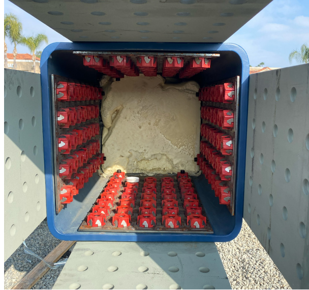
An HSS 22x22x7/8 set up for a bolted splice using Shuriken.

However, Atlas' domestic Jumbo HSS was not the only innovation that made the bridge a reality. While the tie girders were large enough to allow ironworkers to reach the interior of the bolted splices, the arch ribs, tie beams, and support diaphragms were not. A new technology at the time, Shuriken® by Atlas Tube, was a logical answer to this challenge. Shuriken allows the installation of A325 and A490 bolts from one side and was the perfect solution to the connection conundrum confronting the team.